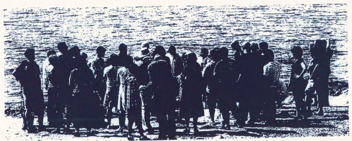
MED.II TOURS - DUAL NARRATIVE TOURS TO ISRAEL AND PALESTINE. 2011 Winner, 1" Place