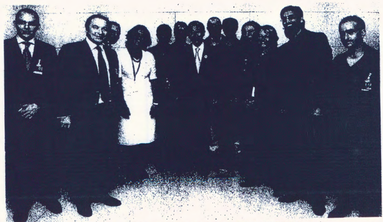
2011 WINNERS OF THE AWARD WITH UN SECRETARY-GENERAL BAN KI-MOON