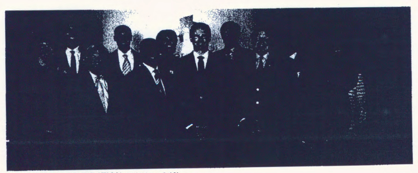
THE MAYTREE FOUNDATION. 2011 Winner, 2nd Place